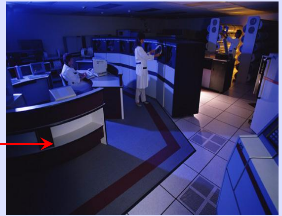
Utility Host Itron/UTS MV-90 Computer Automated Dial-out Meter Reading System