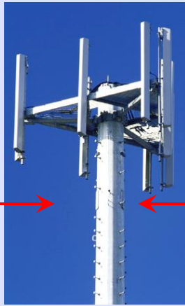
Public Digital Cellular Network