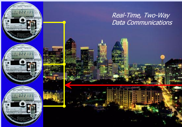
MARK-V Meters with StarBurst Integrated Digital Cellular Communications installed on Commercial and Industrial Accounts